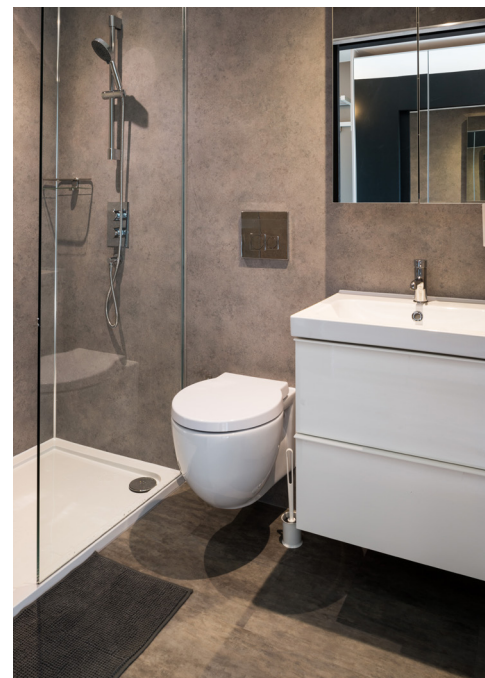
Cool Mica used in ensuite shower room Farrier House.

Stannary Solutions also intend to use Spapanel in further student developments.