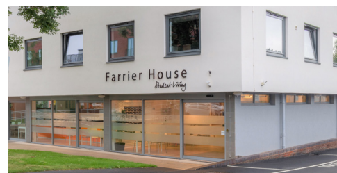
Photos of Farrier House Student Living, courtesy of Stannary Solutions Limited.

“We also act as landlords at Farrier House, so it was important for us to ensure tight control over future ongoing maintenance costs, and that’s one of the reasons why we selected high quality contemporary products like Spapanel that require only minimal maintenance and are easy to clean — ones tough enough to withstand the inevitable heavy wear and the occasional knock from residents.